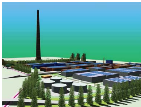
Figure 6. Example of proposed situation for area rehabilitation (designed by arh. Alexandru Baban, 2012)