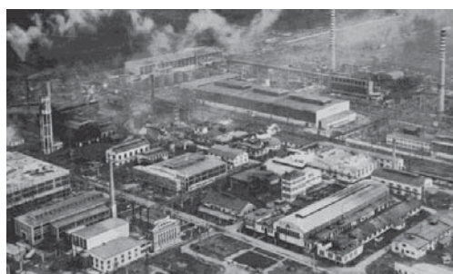
Figure 2. Phoenix plant

of 2003 – 2004, Cuprom bought the Phoenix Baia Mare plant and the Company of Laminated Electric Cable that was founded in 1972. Because of the modernization process and the new technologies that were implemented and also because of the financial investments, it became the biggest copper production company from Romania and one of the largest from Eastern Europe. This lasted until September 2008 when the company faced bankruptcy after the price of copper collapsed suddenly (Cuprom SA, Reorganization plan, 2010).