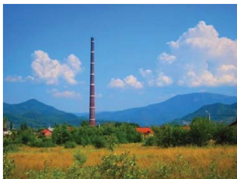
Figure 4. Cuprom chimney, a landmark of Baia Mare

The Cuprom chimney (Figure 4), with a height of 351.5 metres, is the tallest artificial building in Romania and the 3 rd in Europe ( http://skyscraperpage.com/cities/?buildingID=56681 ). This makes it very valuable for a future redevelopment of the area.