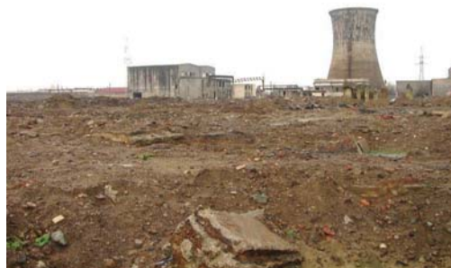
Figure 5. The current status of the Cuprom site

The most important step in the reconversion of the area is the decontamination and greening of the land.