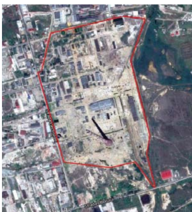
Figure 3. Satellite view of Cuprom area ( https://www.google.ro/maps/@47.6545769,23.601314,1415m/data=!3m1!1e3?hl=en )

In 2002, former Cuprom SA (Figure 3), RGB Phoenix Baia Mare was on the hot spot list of Greenpeace for water pollution. The causes of pollution stated by the organization were wastewater discharges loaded with heavy metals. Greenpeace asked for an effective operation of waste water treatment plant (Greenpeace, 2002).