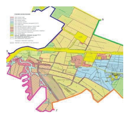
Figure 1. Fragment of the land use plan in the territory of Zabolotskaya village council of Vladimir district of Rivne region, Ukraine

The factors that impede the ecological, economic and social efficiency of agricultural use of drained lands can be seen in the fragment of the land use plan in the territory of the Zabolotskaya village council of the Volodymyretsky district of Rivne region of Ukraine (Figures 1 and 2), where part of the Zabolotivskava drainage system was constructed in 1963-1967. From the Figure 2 you can see that the majority (almost 80%) of the drained land is owned by the citizens-land parcels owners and the peasant farms which are cultivated independently.